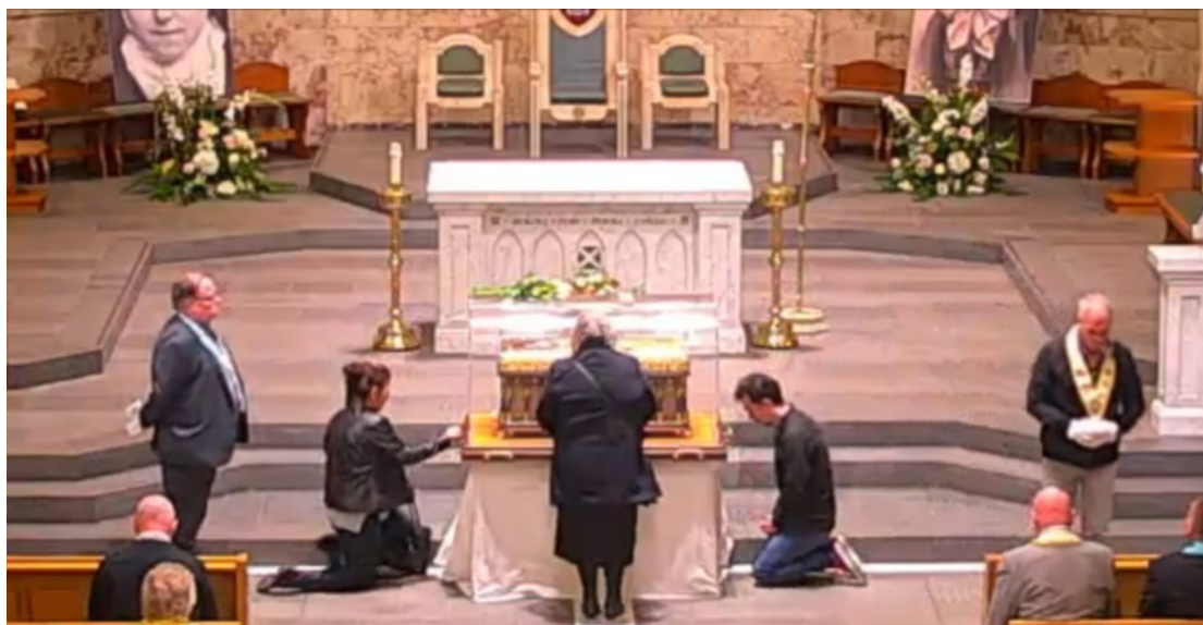
Members of the public venerate the relic of St Thérèse of Lisieux, St Andrew's Cathedral, Glasgow