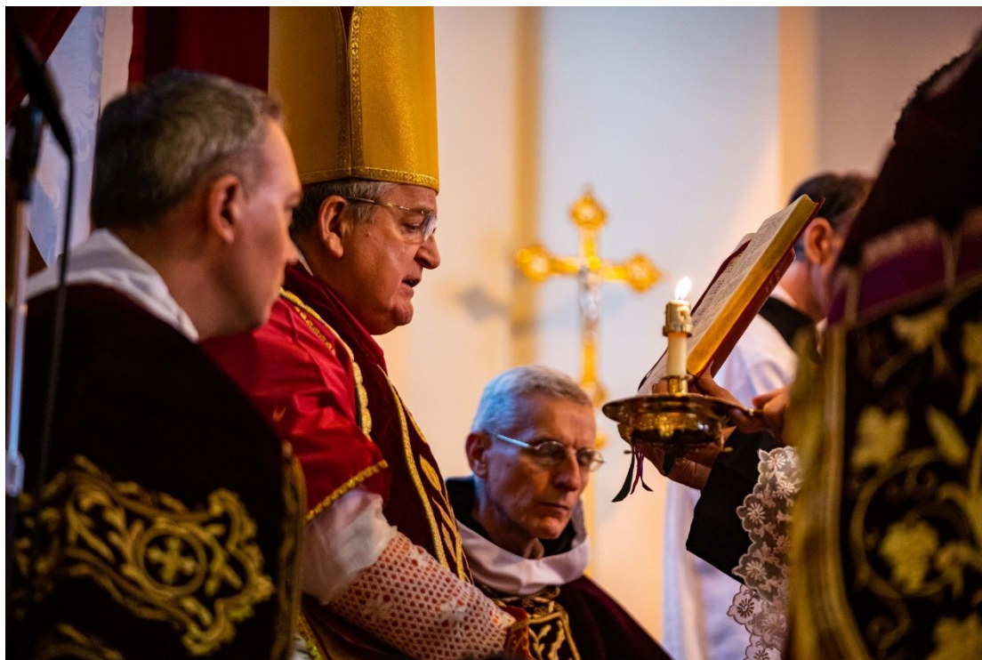
Pontifical High Mass celebrated by His Eminence, Raymond Leo Cardinal Burke on the Feast of the Exaltation of the Holy Cross at the church of the Immaculate Heart of Mary, Balornock

Una Voce Scotland was founded in 1965 for the preservation and restoration of Holy Mass in the Traditional Roman Rite, for the fostering of Gregorian Chant, and for the defence of the sanctuaries of Catholic Churches.