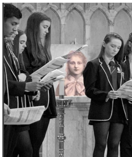
Senior pupils leading a reflection at St Andrew's Cathedral

Before entering the Cathedral I advised the young people that, if they had a holy item with them they could touch it to the relics and that it would itself become a third class relic that they could use for their own prayer at home. One pupil who did not have an item informed her friend afterwards that she herself, having venerated the relics, was a third class relic. The friend was not to be outdone and exclaimed that she then, was a first class relic! That is the point! The visit of the relics have communicated to us in a new way, through the simplicity of the Little Way that we are destined to be saints- first class relics, if you like.