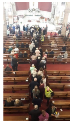
@sfmmossend (above and right)