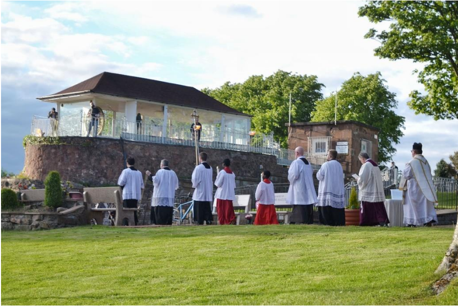
The procession at Carfin Grotto

Una Voce Scotland was founded in 1965 for the preservation and restoration of Holy Mass in the Traditional Roman Rite, for the fostering of Gregorian Chant, and for the defence of the sanctuaries of Catholic Churches.